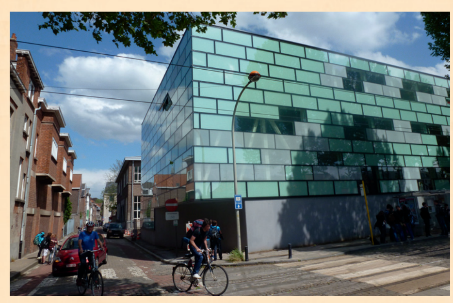
Gent - aan de Coupure, hoek Theresianenstraat - anno 2012.