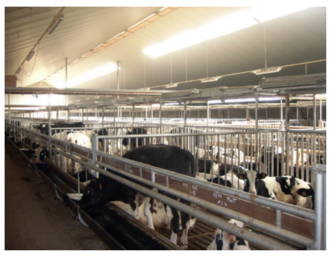
Figure 3. Group housing of 26-weeks-old Holstein Friesian veal calves in a one compartment stable.