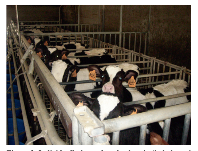
Figure 2. Individually housed veal calves in 'babyboxes' on slatted floors during the first six weeks of production.

At the age of 8 weeks and for the remaining of the production cycle, group housing is obligatory with a minimum surface area of 1.8 m<sup>2</sup> per calf (Figure 3). The most common group housing system applied in Europe is housing on slatted floors in small pens of 4-8 animals. Predominantly in France, calves are raised in larger groups (30-60 calves) and fed by automatic milk delivery devices. In addition, there are several systems, which implement additional animal welfare standards, in the Netherlands (Peter's farm) and Switzerland (naturafarm) (Bokkers and Koene, 2001; Bähler, 2009a, b). The additional welfare claimed in the Peter's farm system is the fact that calves are housed in larger groups (35 to 60 calves)