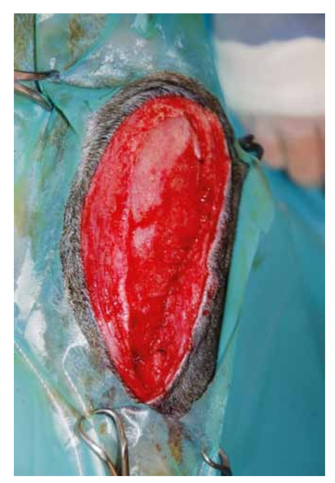
Figure 5. Photograph of the wound on day 5, after two 48-hour cycles of NPWT. The wound bed appeared healthy with extensive granulation tissue formation on all surfaces, allowing surgical wound closure.

After 48 hours of consecutive continuous negative pressure at -75 mmHg, a total amount of 200 mL fluid was present in the collection canister. The patient was anesthetized a second time, as described previously, to renew the dressing (day 3). The polyurethane foam and nanocrystalline silver-coated dressing were removed after cutting the polyurethane drape along de edges of the wound with a scalpel. The polyurethane drape that was attached to the skin was left in place. The defect had partly filled with granulation tissue with no visible signs of additional necrosis. Cytology of the wound bed was repeated. There were no signs of inflammation or bacteria. The wound was flushed with sterile saline. The distal half of the caudal border of the incision in the superficial leaf of the fascia lata was sutured to the lateral aspect of the vastus lateralis muscle to provide a protective layer over the sciatic nerve. A new silver-impregnated polyurethane foam