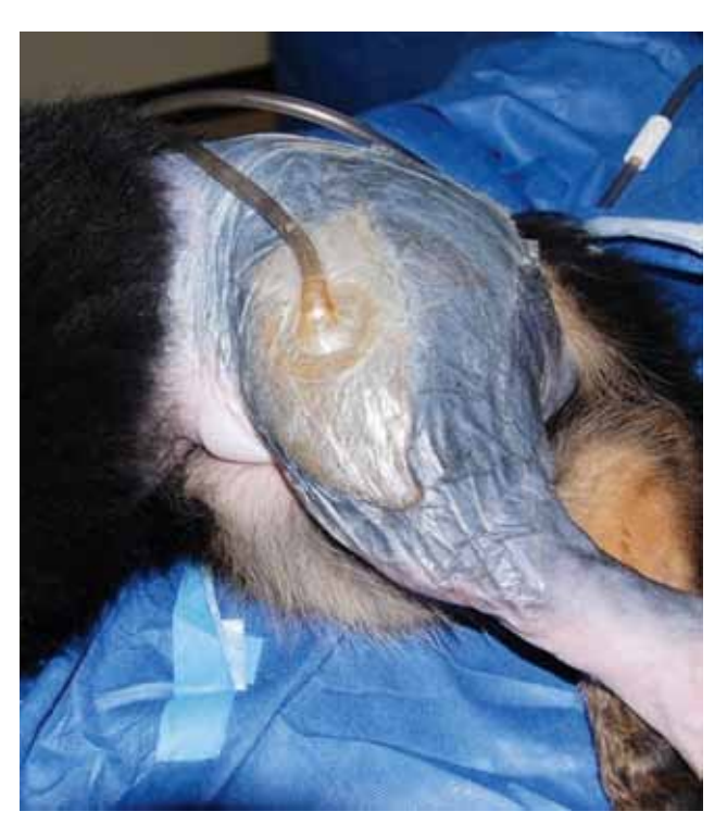
Figure 4. Photograph after application of a NPWT device. A silver-impregnated polyurethane foam dressing was placed inside the wound (including the associated cavity) and covered with a polyurethane adhesive drape. An interface pad and extension tubing were then applied onto the drape over a 2 cm-diameter opening created in the drape, and connected to the negative pressure source.

Surgical exploration of the swelling was done within 24 hours, when the patient was stable for anesthesia (day 1). The patient was premedicated with methadone (0.2 mg/kg IV) and subsequently induced 15 minutes later using propofol (Propovet®, Abbot, Berkshire, United Kingdom) administered to effect (total dose of 6 mg/kg IV). After endotracheal intubation, anesthesia was maintained with isoflurane (Isoflo®, Abbot, Berkshire, United Kingdom) vaporized in 100% oxygen using a rebreathing system. The patient was positioned in right lateral recumbency, clipped and aseptically prepared for surgery. A standard lateral approach to the femoral diaphysis was performed with the skin incision made craniolateral to the femoral diaphysis, extending from the level of the greater trochanter to 2 cm proximal to the stifle joint. After incision into the superficial leaf of the fascia lata and caudal retraction of the biceps femoris muscle, a large fluid filled cavity extending along the lateral and caudolateral aspect of the femur, and the lateral aspect of the adductor magnus muscle, became evident (Figure 3). The sciatic nerve was exposed caudolaterally in the surgical wound. About 80 mL of red brown fluid was drained from the cavity by suction. The fascia overlying the vastus lateralis and adductor magnus et brevis muscles was slightly yellow in color with a frayed appearance, and it easily disrupted under digital palpation. The biceps femoris muscle belly