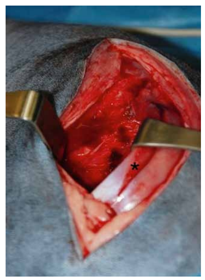
Figure 3. Photograph of the affected hind limb during surgery on day 1. An incision was made into the superficial leaf of the fascia lata. Retraction of the biceps femoris muscle revealed a fluid-filled pocket extending along the lateral and caudolateral aspect of the femur. A 5 cm fasciotomy was made in the biceps femoris muscle (asterisk).

tissues caudolateral of the femur had a diffuse hyperechoic appearance interlaced with hypoechoic strands indicative for inflammation and edema. The fluid in the cavity was aspirated under ultrasonographic guidance, and fine-needle aspirates were taken of the perimuscular tissue. Cytology and bacterial culture and sensitivity testing were performed. The cytological findings from both locations were consistent with a suppurative inflammatory process consisting of degenerative neutrophils with chains of cocci both intraand extracellularly.