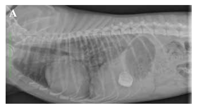
Figure 2. Right lateral (A) and ventrodorsal (B) control radiographs 48 hours later. Patchy, peripherally located interstitial to alveolar pattern, normal vasculature (no dilation of pulmonary artery). Three foreign objects (bottle caps) are present in the stomach.

alveolar pattern (Figure 2), a radiographic pattern that is characteristic of A. vasorum, and potentially caused by pulmonary hemorrhage or non-cardiogenic edema. Fecal samples were collected during two consecutive days. Using the Baermann technique, multiple L1 larvae in the fecal sample could be identified as A. vasorum L1 larvae (Figures 3 and 4) and a fenbendazole treatment (Panacur<sup>®</sup>, Intervet Int. via MSD AH, Belgium; 50 mg/kg SID) was started and continued for 21 days. Amoxicillin-clavulanate treatment (Kesium<sup>®</sup>, Sogeval, France; 12.5 mg/kg BID) was started because the dog also developed fever, and there was a risk of secondary infection. After two days of hospitalization during which the packed cell volume had increased up to 25%, the dog was discharged and removal of gastric foreign bodies was advised after complete resolution of pulmonary disease and coagulopathy.