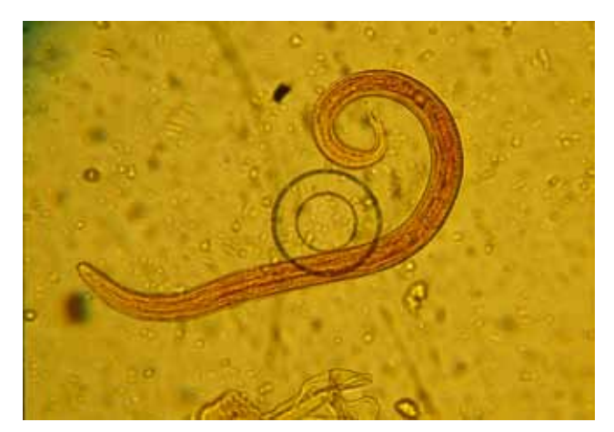
Figure 3. Iodine stained L1 larva of Angiostrongylus vasorum (x20).