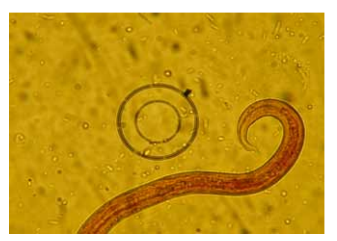
Figure 4. Close-up of the typical S-shaped tail of an iodine stained Angiostrongylus vasorum L1 larva (x40).

seen in very young animals. In most cases, more chronic signs of tachypnea, tachycardia and coughing (often hemoptysis) can be seen. When the right ventricle is affected, endocarditis of the tricuspid valve and right heart dilatation by pulmonary hypertension are potential pathological changes. Less common, but more severe, are bleeding disorders or coagulopathies. They often lead to the death of the patient, although the underlying mechanism for coagulopathy caused by A. vasorum is incompletely understood (Morgan and Shaw, 2010). Proposed underlying mechanisms are DIC, immune mediated thrombocytopenia, thrombocytopathy, e.g. acquired deficits in von Willebrand factor, coagulation inhibitors secreted by the parasite or accumulation of immune complexes stimulating the intrinsic coagulation system (Adamantos et al., 2015; Whitley et al., 2005). Possible clinical signs may be reduced blood-clotting capacity, subcutaneous hematomata, uncontrollable bleeding after injury, petechiae and hemorrhage in the abdominal or thoracic cavities or the lungs. However, routine laboratory tests to assess coagulopathy may be normal despite infection and bleeding tendency. Four percent of infected dogs show various neurological signs, which are thought to