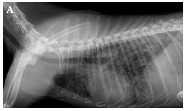
Figure 1. Right lateral (A) and ventrodorsal (B) radiographs performed by the referring veterinarian. Diffuse interstitial to alveolar pattern, more pronounced in right hemithorax. Vasculature cannot be evaluated.

coagulopathy, e.g. due to rodenticide poisoning, disseminated intravascular coagulation (DIC) or Angiostrongylus vasorum infection, or local lung pathology, such as neoplasia. According to the owners, the dog did not suffer from trauma, and no clear signs of local lung pathology were present. Therefore, a coagulopathy was suspected, although platelet count (blood smear), PT and aPTT were within normal limits. The dog was mildly sedated with butorphanol (0.04 mg/ kg) and the buccal mucosal bleeding time (BMBT) was measured to detect possible thrombocytopathia. However, the test result was within normal limits. A complex coagulopathy without obvious laboratory abnormalities was suspected and a fresh frozen plasma transfusion (10 ml/kg) was initiated. Packed red blood cells were not administered, since there were no signs of decompensated anemia. Oxygen supplementation was not necessary, since the dog was not dyspneic.