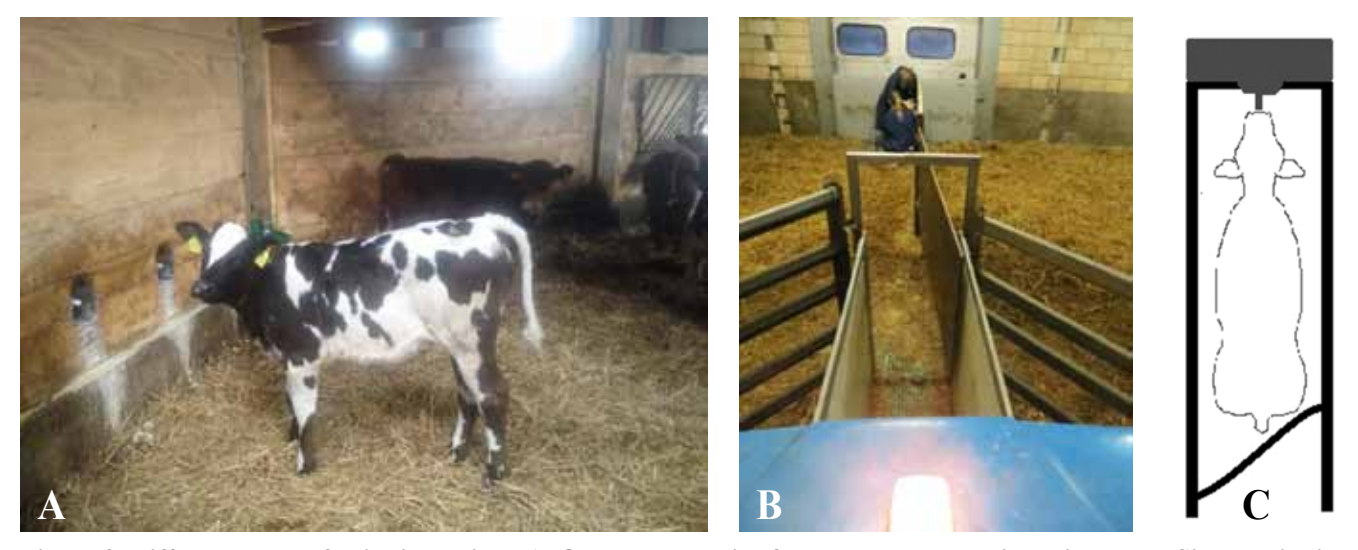
Figure 2. Different types of drinking points. A. Open system with free access and multiple nipples. B. Single drinking point with open access. C. Protected drinking point.

The AMF drinking points are either freely accessible (Figures 2A and 2B) or are protected (Figure 2C). A disadvantage of free access is that dominant animals may expel other animals, thus limiting feed uptake of the latter category. Protected systems consist of gates, which allow the calf to drink undisturbed. A drinking point can either be equipped with a nipple (Figure 1B) or a drinking cup (Van Gansbeke, 2007).