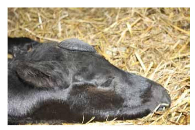
Figure 1. Macroscopic lateral view of the black, flat, oval, pedunculated exophytic mass with a rubber aspect of approximately 10 x 9 x 3 cm on the foal's forehead.

pin et al., 2013). The latter are benign tumor-like lesions consisting of hyperplasia of normal mature tissue components, due to an embryonic developmental error (Stosiek et al., 1994; Campen et al., 2003). Based on these histological similarities between equine congenital papillomas and human nevi, some controversy in terminology has been introduced in the veterinary literature. However, the combination of epithelium and fibrous tissue as seen in the present case, has not been described in human nevi. Therefore, the authors prefer the term congenital fibropapilloma in this case, which previously has only been described in piglets (Vitovec et al., 1999; Nishiyama et al., 2011).