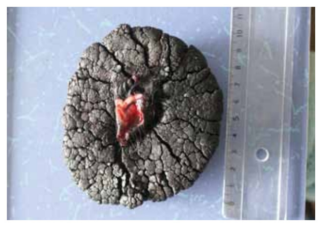
Figure 2. A. Macroscopic dorsal and B. ventral view of the mass after surgical excision through the vascularized peduncle.

A viral component in this disease would open perspectives for medical treatment and/or vaccination in