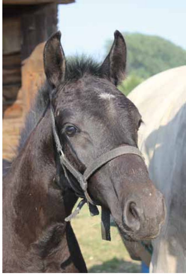
Figure 3. Macroscopic view of the foal two months after excision of the mass.

It is unclear whether spontaneous regression would be possible in large lesions as described in the present study. Retrospective analysis of a larger sample of histologically confirmed cases and follow-up of cases without surgical treatment are needed to elucidate this issue. Based on the low prevalence, multicenter studies will therefore be required. Moreover, additional molecular studies are required to investigate whether or not papillomavirus is involved in this pathology.