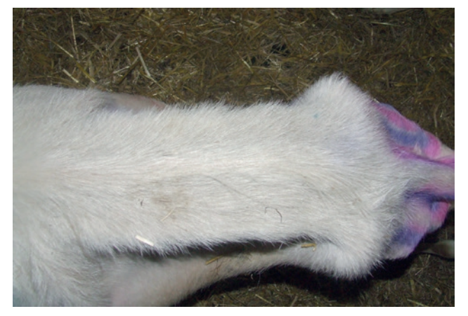
Figure 2. Detail of the lumbar region in a dairy goat with cachexia as a consequence of paratuberculosis.

Next to culture and Ziehl-Neelsen staining, antibody ELISA can be performed on milk or serum. The SE and SP for milk and serum are comparable, and ELISA on milk has been suggested as a good screening tool for dairy goat farms (Windsor, 2015). Since 2007, the Flemish Animal Health Service (Diergezondheidszorg Vlaanderen) offers an antibody ELISA on milk with a SE of 86.7% and a SP of 99.7%, in Belgium. The problem with ELISA is that antibodies are detected, which are only present during the humoral T<sub>H</sub>2-immunity stage, after the cell-mediated T<sub>H</sub>1-immunity stage. The T<sub>H</sub>2-immunity is suppressed by the cell-mediated T<sub>H</sub>1-immunity, which starts shortly after infection. Therefore, there is a high risk of false negative results when testing serologically with ELISA before the humoral T<sub>H</sub>2-immunity stage (Kostoulas, 2005). ELISA is not suitable to quantify the number of MAP bacteria and to detect paratuberculosis before the humoral stage. The most recently available