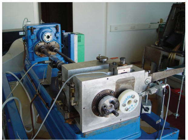
Figure 1. Shows the twin disc FZG test setup

Both the metal and composite samples were cleaned before and after the measurements. The contact surface of the counterface material is cleaned with metal sponge, acetone and alcohol (Loctite 7061), the same is used for the composite material except for the metal sponge which could change the surface parameter of the composite. Micrograph of the contact surface is taken at all intervals using a SFX microscope (Olympus) and a video camera (QICAM). Change is roughness of the contact surface is measured after every interval using a roughness tester (Homel).