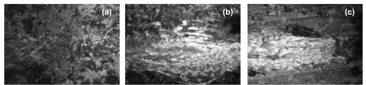
Figure 4. shows the contact surface of the composite (a) before contact (b) low load (c) high load

damages. But, on the other hand images shown in Figure 4. (b) & (c) from the tested surface displays pits and abraded surface.