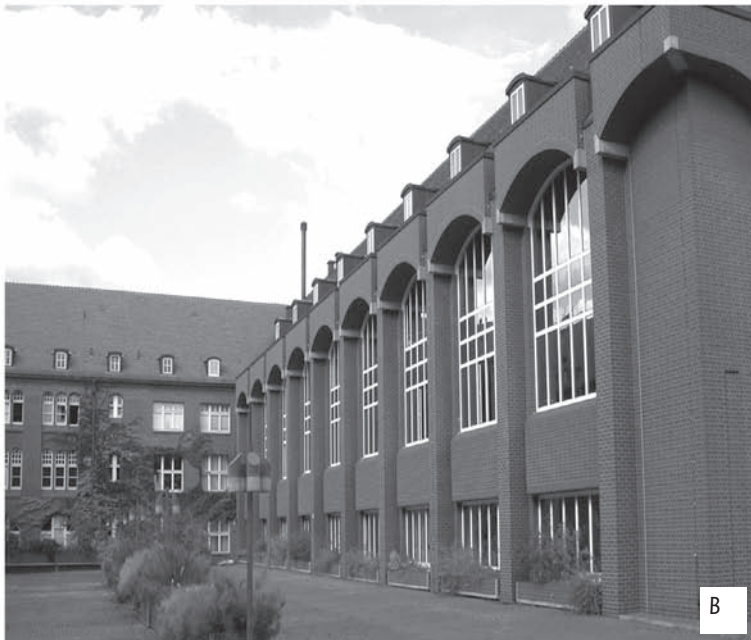
Fig. 1. The Botanical Museum Berlin-Dahlem (B). A) After its destruction in 1943; the herbarium was kept in the wing on the right hand side. B) After its restoration in 1987; the herbarium is now kept underneath the central area in the front of the picture; today the wing on the right hand side contains the library.